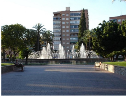
Murcia (Plaza Circular)

Tram stops (towards the City-center): ... Centro Social - Biblioteca General- Residencia Universitaria- Los Rectores Terra Natura- Espinarado-El Puntal- Parque Empresarial - Senda de Granada - Biblioteca Regional- Juan Carlos 1- Plaza Circular -.... (you should get off at Plaza Circular to walk towards the city center).