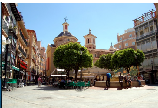
La plaza de las Flores (Murcia)