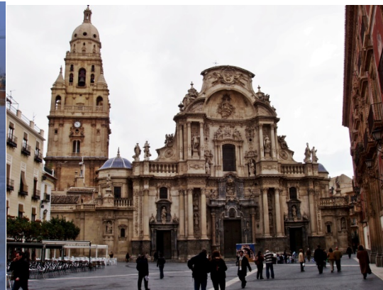
Murcia City Center (Cathedral Square)