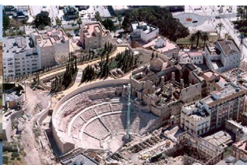
Cartagena (35 min from Murcia by bus)

My colleagues and I look forward to welcoming you all in Murcia next September. We shall be looking after you and we will do our very best to help you with anything you may need while been here.