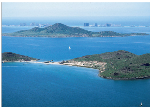
La Manga del Mar Menor (coast)

Weather-wise the end of September is still summer in Murcia although at night the temperature may go down slightly to 17 to 22 degrees and so, you may bring a light coat if you wish!!!! Umbrellas are advisable but most likely you won't need them. Put your summer costumes in the bag if you are planning to stay for a bit longer and visit the coast.