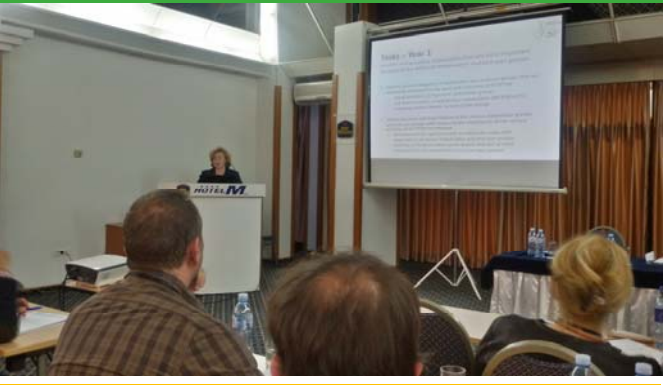
POSITIVe Opening Meeting in Belgrade, Serbia