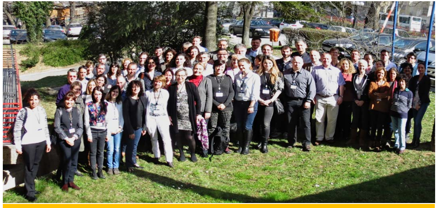
POSITIVe members attending the Opening Meeting in Belgrade, March 2015

The main tasks proposed and objectives achieved by each WG during the meeting in Belgrade are summarized in this section.